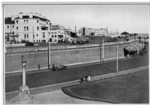
THE RETAINING WALL. Between the Upper and Lower Esplanades.

22. Behind Captain Cook's statue is the embankment of the Esplanade, once a sandstone bluff. The traditional Aboriginal owners of the Kulin Nation used the sandstone to sharpen their axes. They